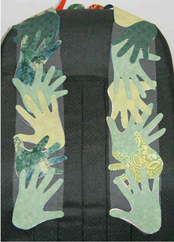
Sample green side of finished stole