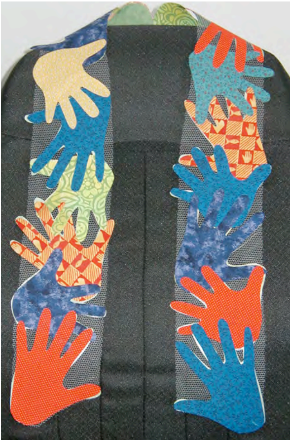
Sample multi-colored side of finished stole